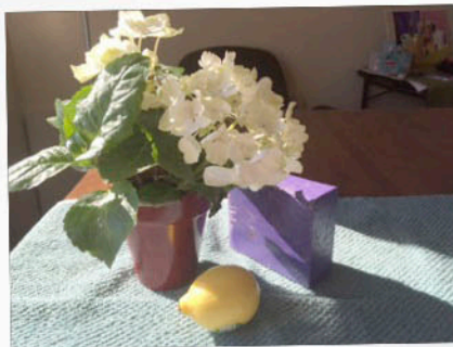
PHOTO OF YOUR SUBJECT

Watching me "work" on your color studies — being able to see on screen which colors I'm picking from my palette to make changes and suggestions — is the next best thing to studying with me in person at my regular Monday morning class.