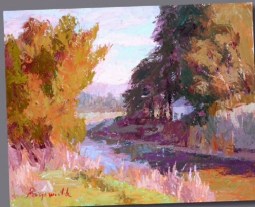
River View North 8" x 10" oil on canvas